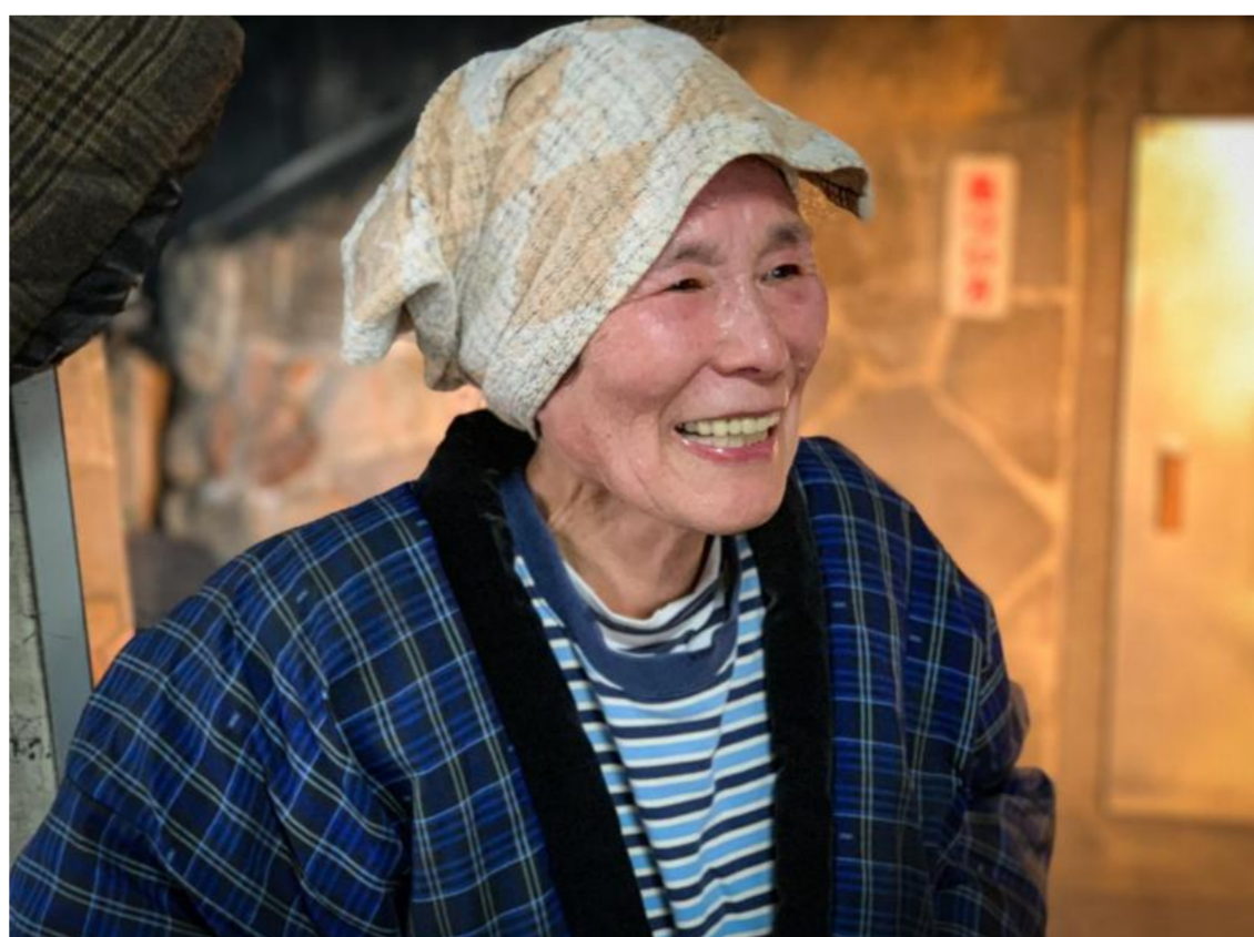
I recently photographed this 80-year-old Japanese woman after she exited a 1300-year old kama-buro in Japan. Her skin was amazingly clear and her smile heart-warming.