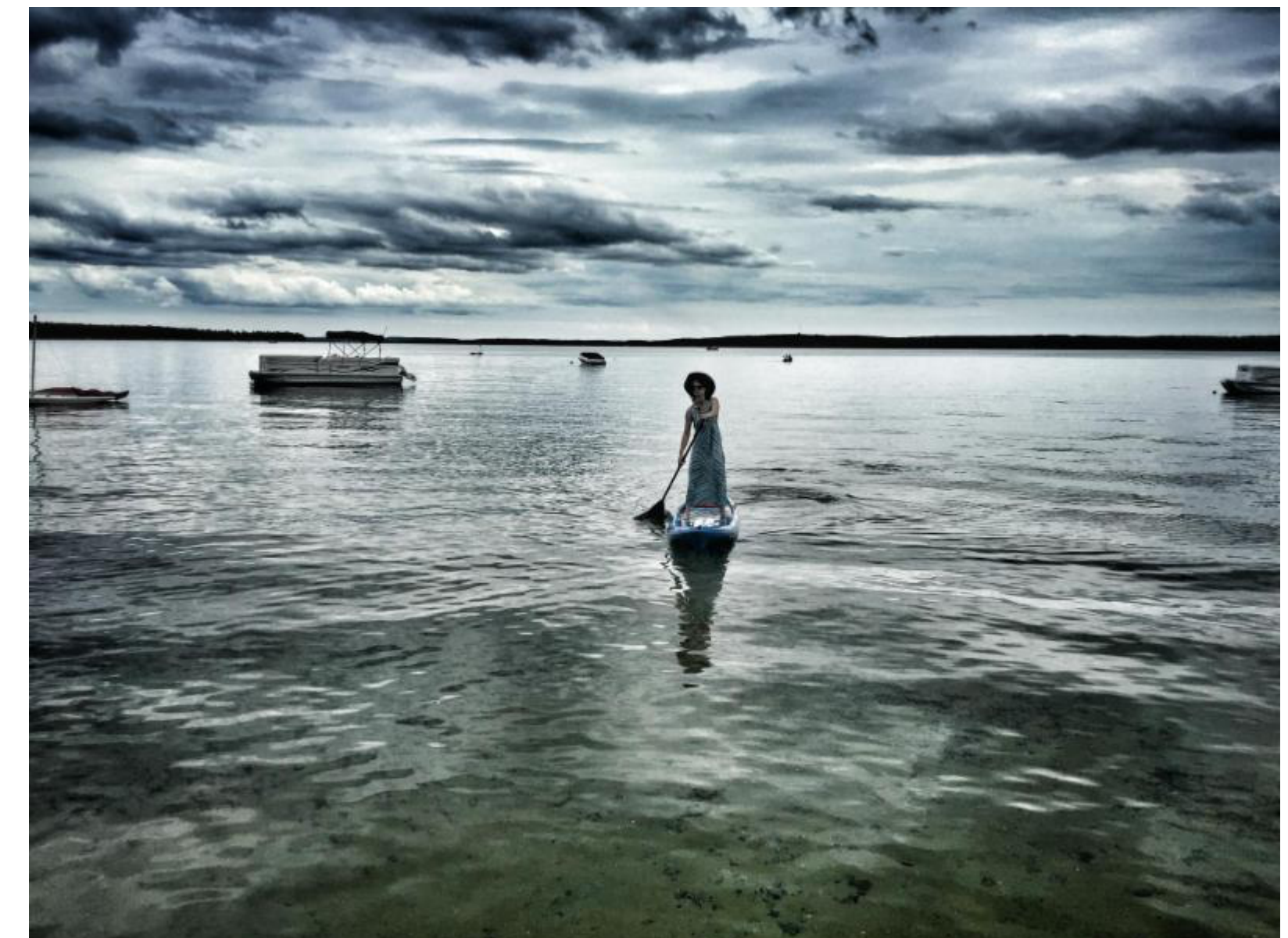
"It's All an Adventure"