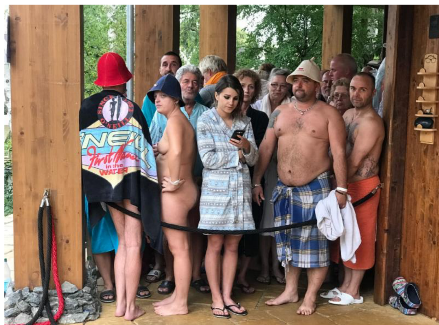
Over 200 bathers are waiting to disrobe and enter the sauna for a performance at Satama Spa, outside of Berlin, Germany. Satama was the site of the 2018 International Sauna Aufguss Championships.

The exception, in my experience, is German-speaking countries, where nudity between men and women is not only socially accepted but actually encouraged. Go to just about any public locker room in Germany and you will see men and women disrobing casually together. In public saunas, which are mostly co-ed, if you enter wearing a bathing suit, odds are some bather will make a disparaging comment. At the International Sauna Aufguss Championship this fall at a resort near Berlin, we filmed at least 200 naked men and women of all ages and shapes pour out from a single coed sauna. It's a sight you had to see to fully appreciate.